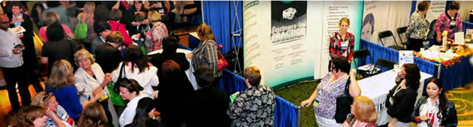
Exhibit Hall Schedule

Exhibit at the 29 th Annual PAHCOM Conference and share your solutions with 200+ medical office managers from around the country. These professionals are the decision makers regarding practice purchases. Even in practices where the doctors make the final call, their office managers are heavy influencers of decisions around practice management and business direction. Meet them face-to-face at this event and see what a difference it makes for your business!